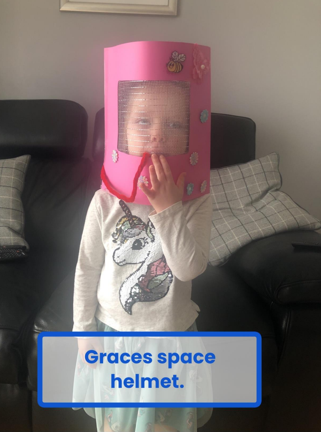
Graces space helmet.