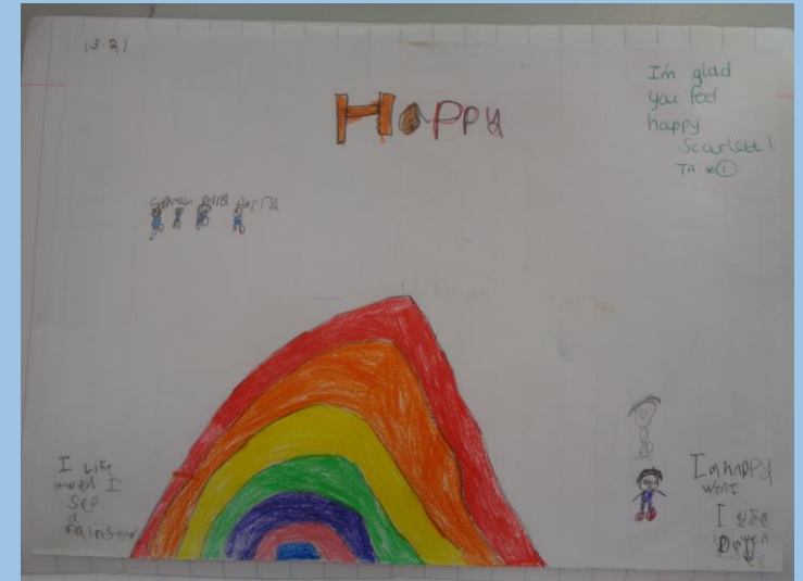
Scarlett feels happy and can't wait to see all of her friends.