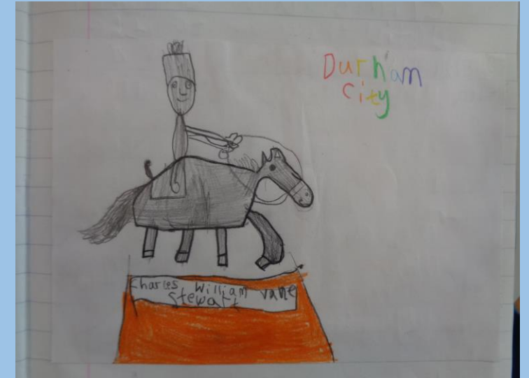
Ella wanted to draw the statue she has seen when she last visited.