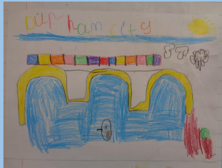
Olly drew one of the bridges crossing over the River Wear.