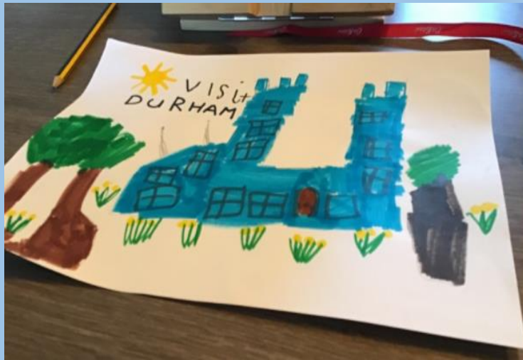
Willow created an eye catching postcard, with the Cathedral on.

In Geography, we have looked closely at Durham City. We have created, 'Wish you were here' postcards.